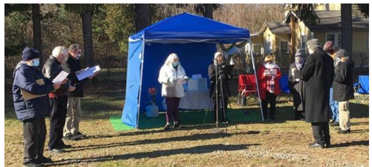
Socially Distanced choir at an outdoor service