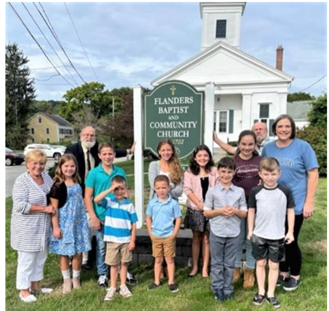
First Day of Sunday School September 11, 2022