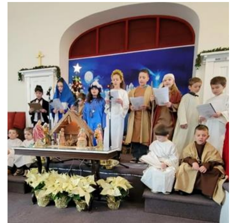
Christmas Play December 18, 2022